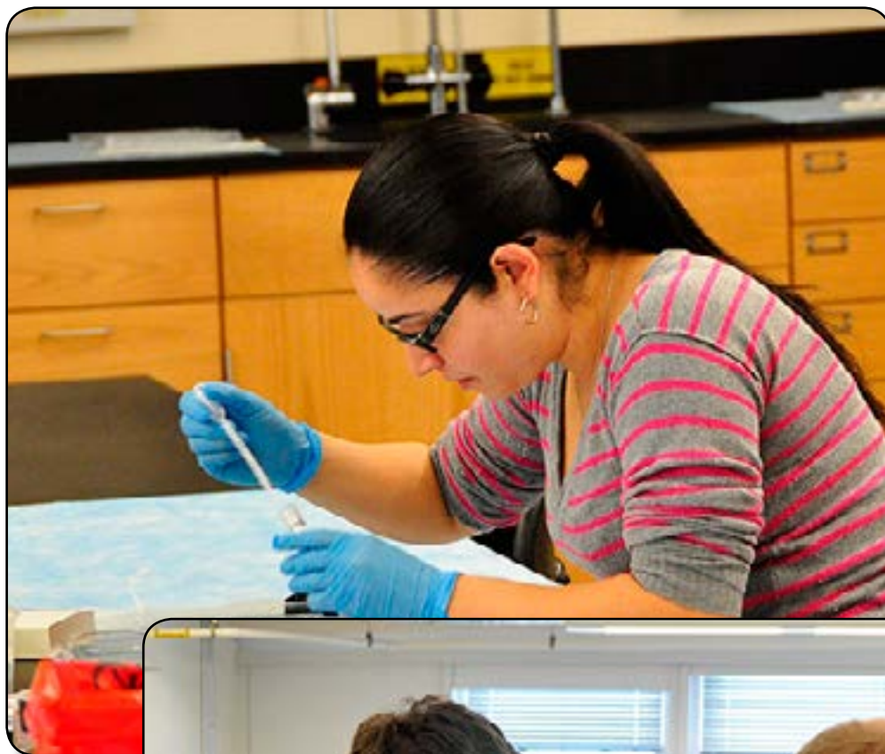
Student working in lab