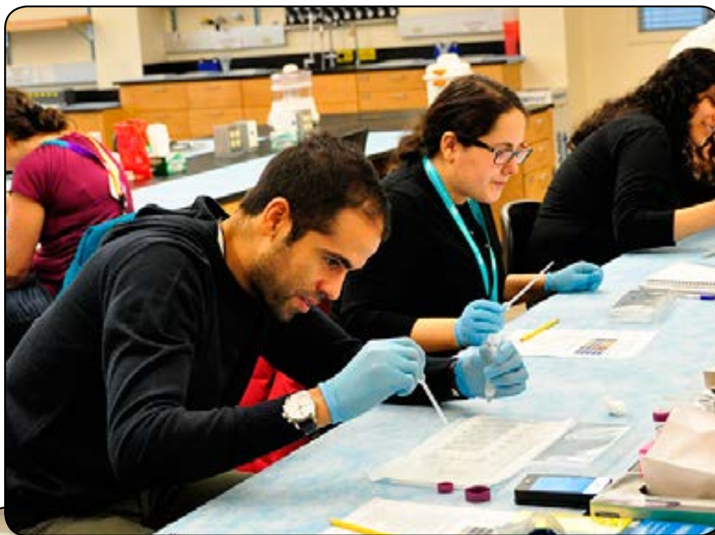
Students applying reagents to slides