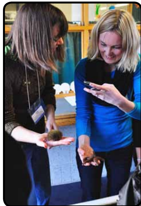
MBL Laboratory Tour 2011