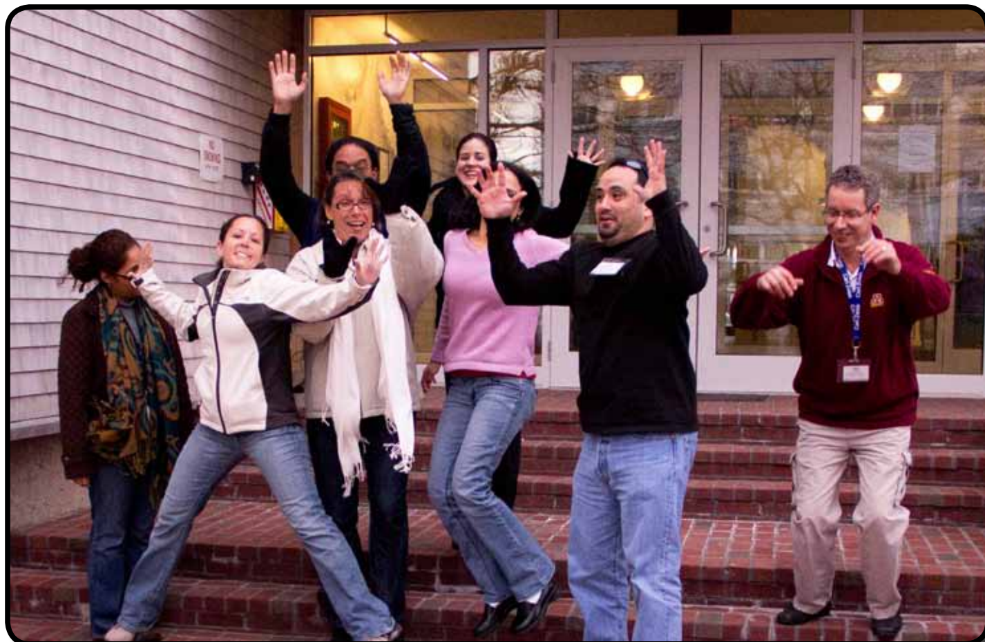
The Joy of a Job Well Done! HCS Short Course 2011

To submit a manuscript, go to : http://mc.manuscriptcentral.com/hcs .