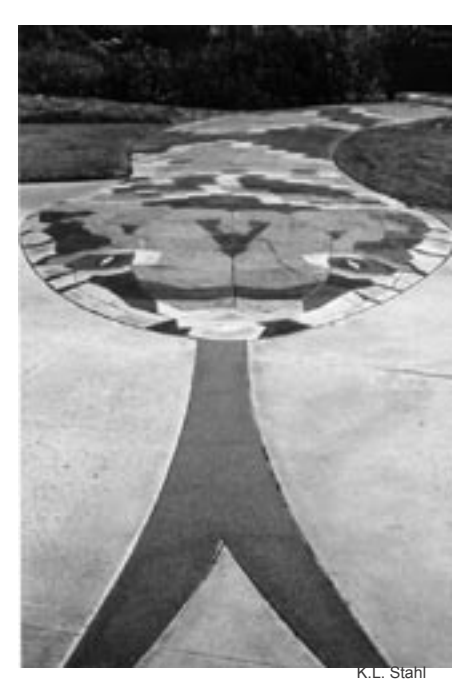
Beginning of The Serpentine Trail