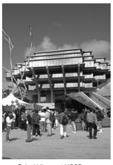
Geisel Library at UCSD