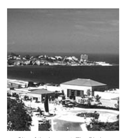
Site of the banquet: The Birch Aquarium at Scripps

Visit the ICHC 2004 Website www.ichc2004.org