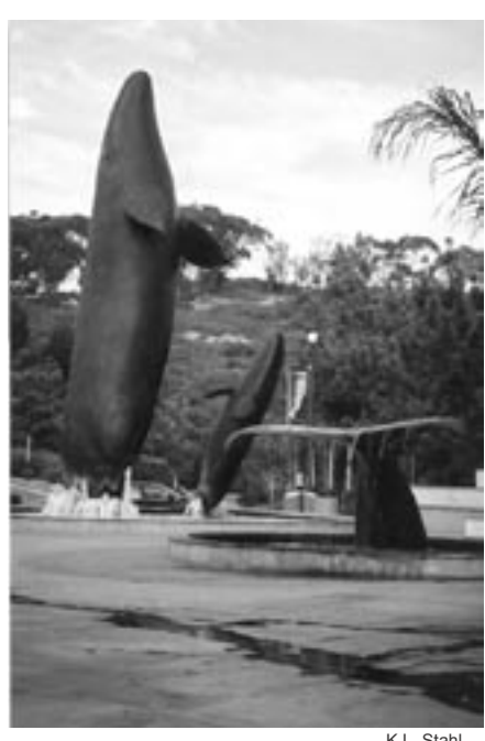
Whale sculptures at the entrance to the aquarium.